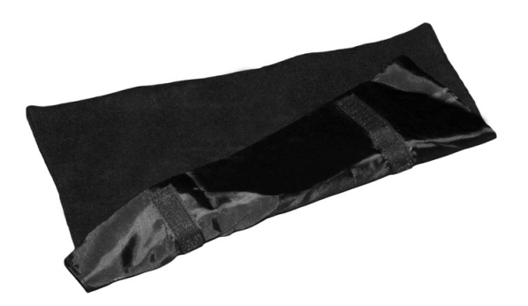
Fleece-Top Comfort Liner with Hook & Loop Fasteners.