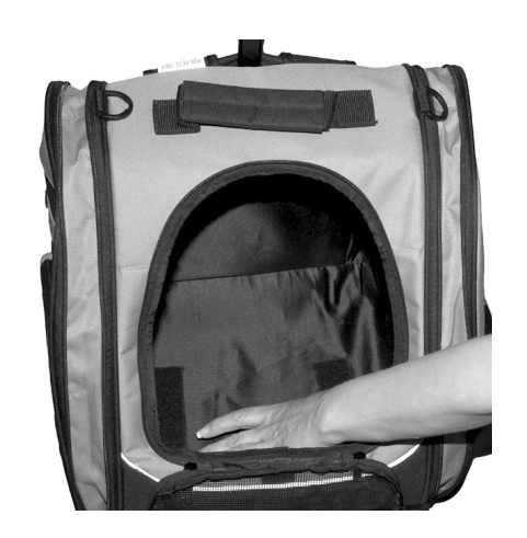
Step 5. Push down on the Reinforcement Board until it lays flat inside of the I-GO2, as shown in Figure E.