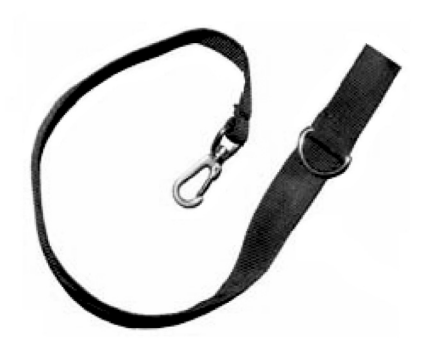
Tether and D-Ring. (This has been sewn into the interior of the unit.)